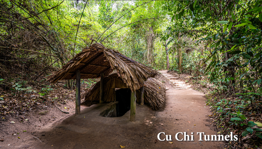
Cu Chi Tunnels